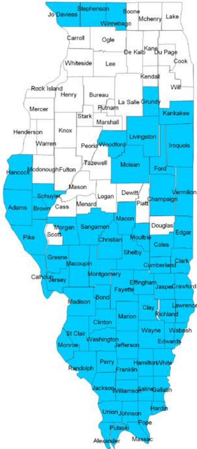
Figure 1. Counties where Yield Exclusion Exists for 2012, Corn (Shaded (blue) counties have YE in 2012)